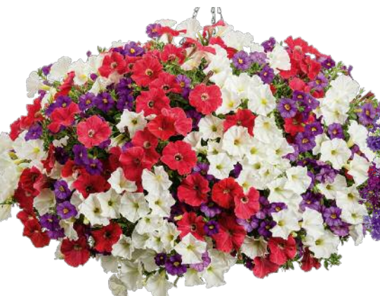
With Liberty SUPERBELLS® Grape Punch™ Calibrachoa SUPERTUNIA® Really Red Petunia SUPERTUNIA® White Petunia