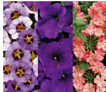
42. Cosmic Cool Superbells® Evening Star™ Calibrachoa Supertunia® Royal Velvet™ Petunia Superbena® Royale Peachy Keen Verbena