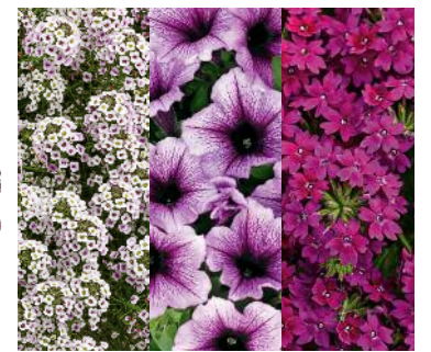
30. Summer Sangria Blushing Princess® Lobularia Supertunia® Bordeaux™ Petunia Superbena® Royale Plum Wine Verbena