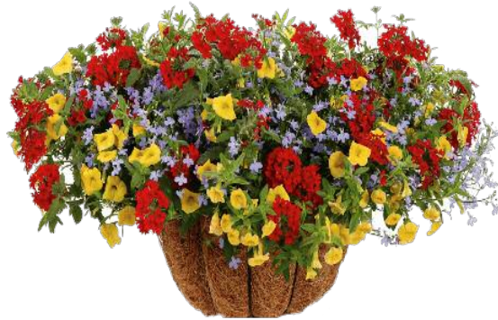
40. Aladdin's Lamp Superbells® Yellow Calibrachoa Laguna™ Sky Blue Lobelia Superbena® Royale Red Verbena