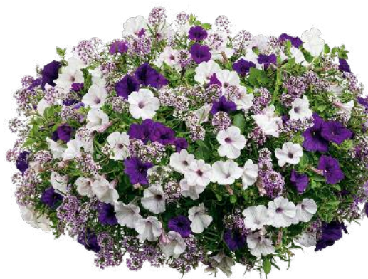
7. Velvet Skies (2013 National Recipe) Blushing Princess® Lobularia Supertunia® Mini Silver Petunia Supertunia® Royal Velvet™ Petunia