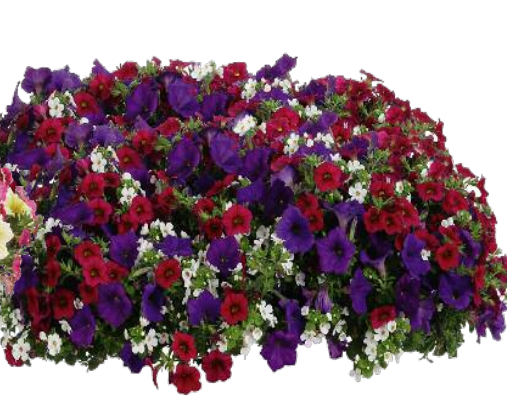
36. Patriotic Moment Superbells® Cherry Red Calibrachoa Supertunia® Royal Velvet™ Petunia Snowstorm® Snow Globe® Sutera