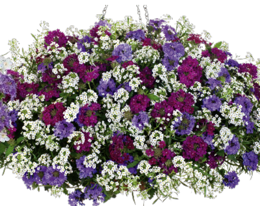
Her Majesty SNOW PRINCESS® Lobularia SUPERBENA® Royale Chambray Verbena SUPERBENA® Royale Plum Wine Verbena