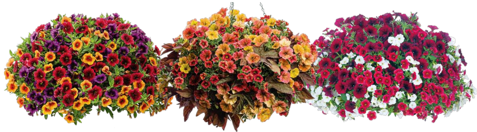
37. Summer Punch Superbells® Apricot Punch™ Calibrachoa Superbells® Grape Punch™ Calibrachoa Superbells® Pomegranate Punch™ Calibrachoa