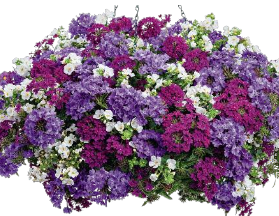
Best Friend SNOWSTORM® Snow Globe® Sutera SUPERBENA® Royale Plum Wine Verbena SUPERBENA® Violet Ice Verbena