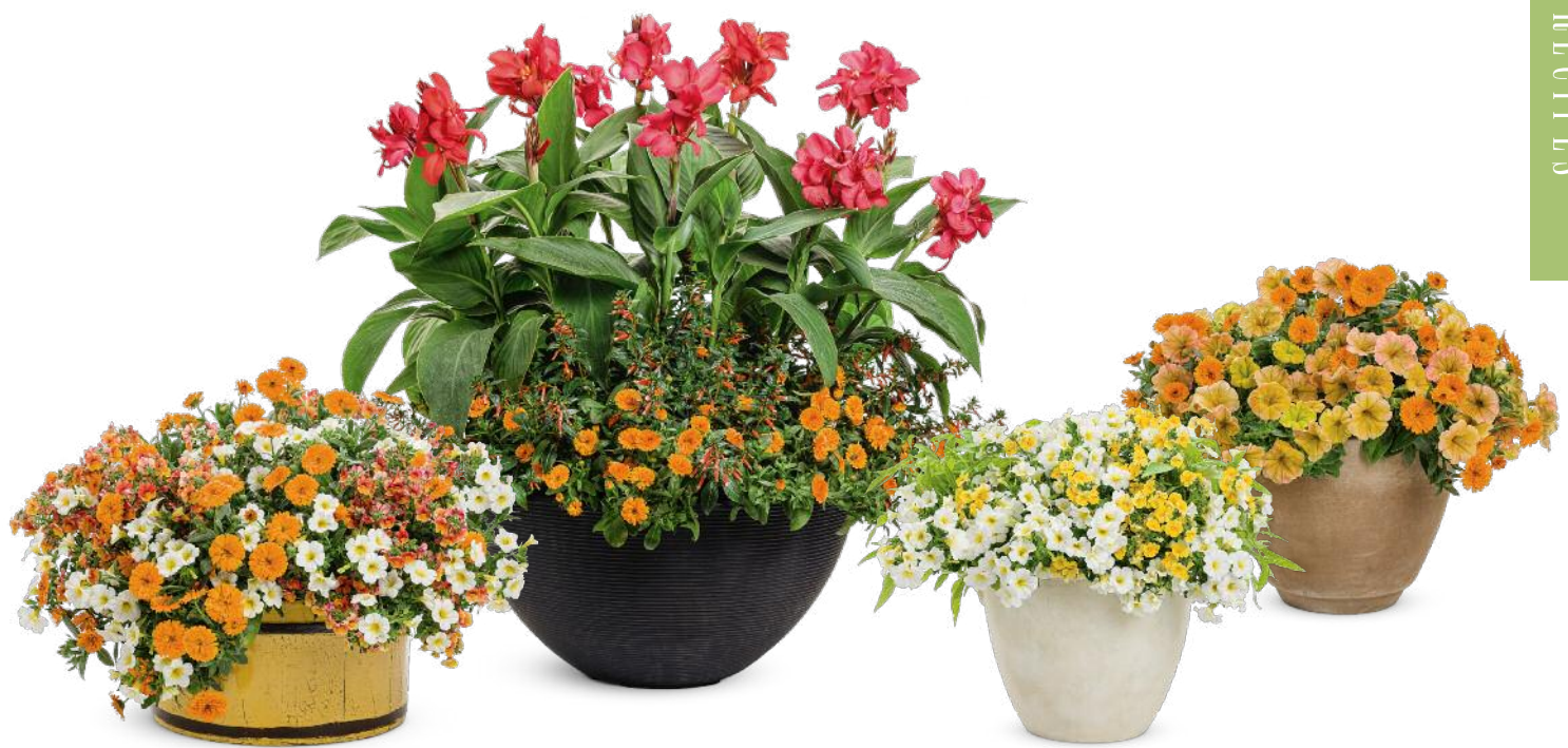
Sunset Boulevard Superbells® Over Easy™ Calibrachoa Lady Godiva™ Orange Calendula Sunsatia® Blood Orange™ Nemesia