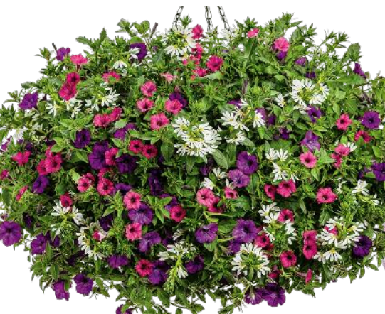
Grandiose SUPERTUNIA® Indigo Charm Petunia SUPERTUNIA® Sangria Charm Petunia WHIRLWIND® White Scaevola