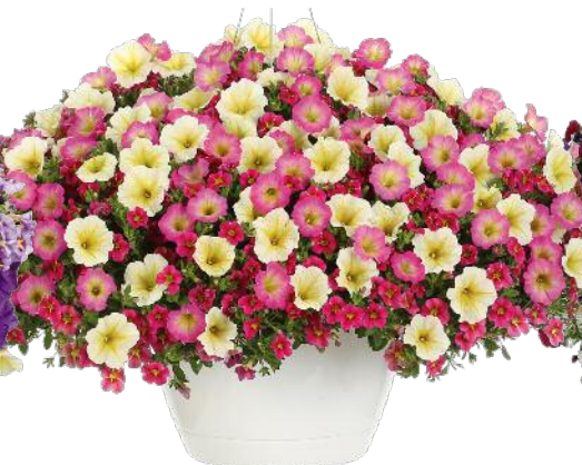
35. Hula Dancer Superbells® Cherry Star® Calibrachoa Supertunia® Daybreak Charm Petunia Supertunia® Limoncello™ Petunia