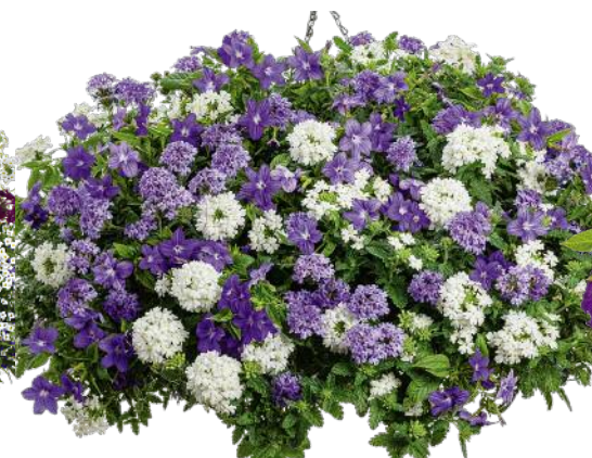
Out of the Blue ENDLESS™ Illumination Browallia SUPERBENA® Royale Chambray Verbena SUPERBENA® Royale Whitecap Verbena