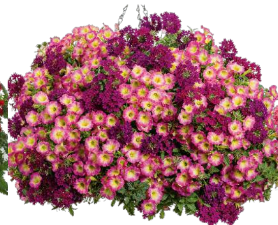
Heart to Heart SUPERTUNIA® Daybreak Charm Petunia SUPERBENA® Royale Plum Wine Verbena