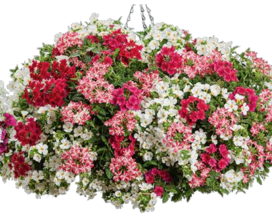
Homemade Happiness SNOWSTORM® Snow Globe® Sutera SUPERBENA® Royale Cherryburst Verbena SUPERBENA® Royale Iced Cherry Verbena