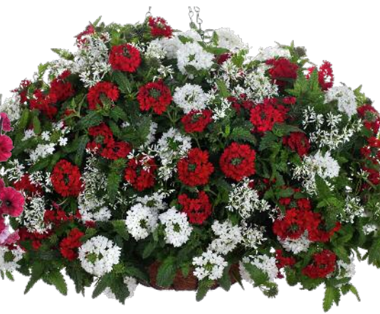
Love Song DIAMOND FROST® Euphorbia SUPERBENA® Royale Red Verbena SUPERBENA® Royale Whitecap Verbena