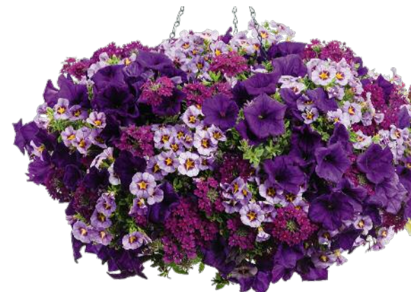
34. Ada Superbells® Evening Star™ Calibrachoa Supertunia® Royal Velvet™ Petunia Superbena® Royale Plum Wine Verbena