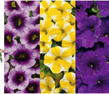
32. Once in a Blue Moon Superbells® Blue Moon Punch™ Calibrachoa Superbells® Lemon Slice™ Calibrachoa Supertunia® Royal Velvet™ Petunia