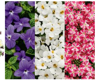
48. Burst of Inspiration Endless™ Illumination Browallia Snowstorm® Snow Globe® Sutera Superbena® Royale Cherryburst Verbena