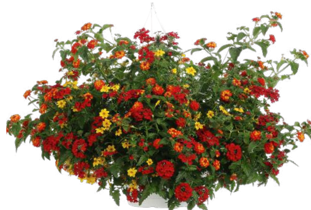
31. Summer Breeze Goldilocks Rocks® Bidens Luscious® Citrus Blend™ Lantana Superbena® Royale Red Verbena