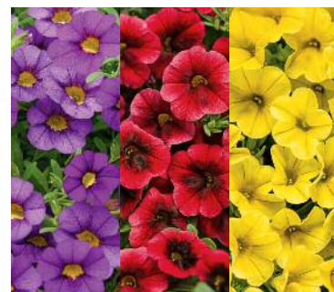
28. Mexican Festival Superbells® Blue Calibrachoa Superbells® Pomegranate Punch™ Calibrachoa Superbells® Yellow Calibrachoa