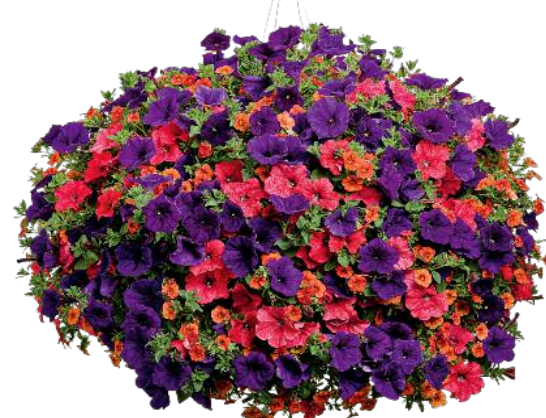
27. Livin' on the Edge Superbells® Dreamsicle™ Calibrachoa Supertunia® Really Red Petunia Supertunia® Royal Velvet™ Petunia