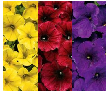
41. Starry Sunset Superbells® Yellow Calibrachoa Supertunia® Black Cherry™ Petunia Supertunia® Royal Velvet™ Petunia