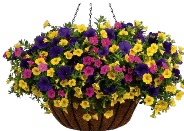
25. The North Shore Superbells® Pink Calibrachoa Superbells® Yellow Calibrachoa Supertunia® Royal Velvet™ Petunia