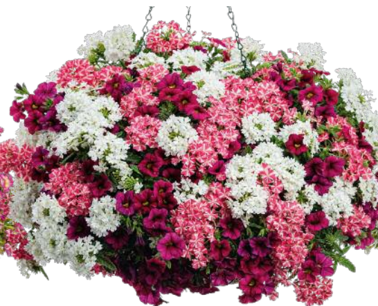
So Sweet SUPERBELLS® Cherry Red Calibrachoa SUPERBENA® Royale Cherryburst Verbena SUPERBENA® Royale Whitecap Verbena