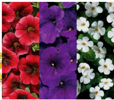
21. Royal Punch Superbells® Pomegranate Punch™ Calibrachoa Supertunia® Royal Velvet™ Petunia Snowstorm® Giant Snowflake® Sutera