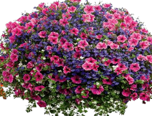
17. New Attitude Lucia® Dark Blue Lobelia Supertunia® Mini Strawberry Pink Veined Petunia Snowstorm® Giant Snowflake® Sutera