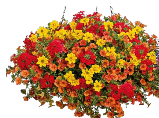
16. Fired Up! Goldilocks Rocks® Bidens Superbells® Dreamsicle™ Calibrachoa Superbena® Royale Red Verbena