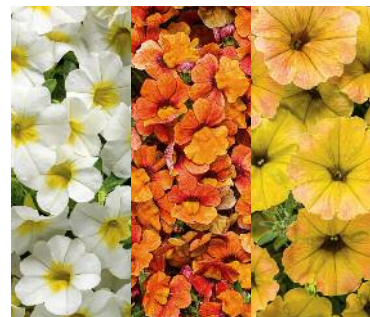
26. Afternoon Bliss Superbells® Over Easy™ Calibrachoa Sunsatia® Blood Orange™ Nemesia Supertunia® Honey™ Petunia