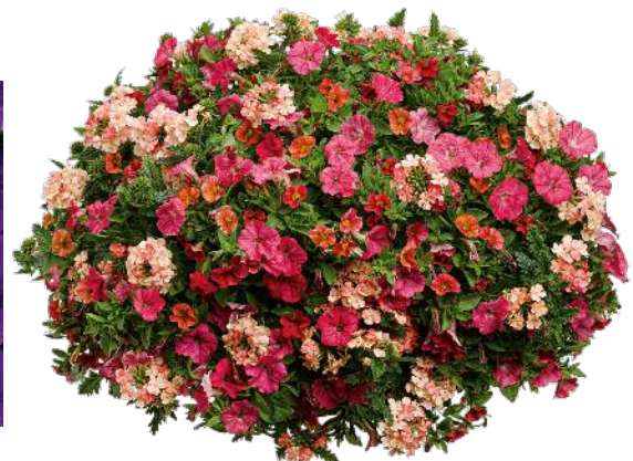
33. Southern Hospitality Superbells® Dreamsicle™ Calibrachoa Supertunia® Really Red Petunia Superbena® Royale Peachy Keen Verbena