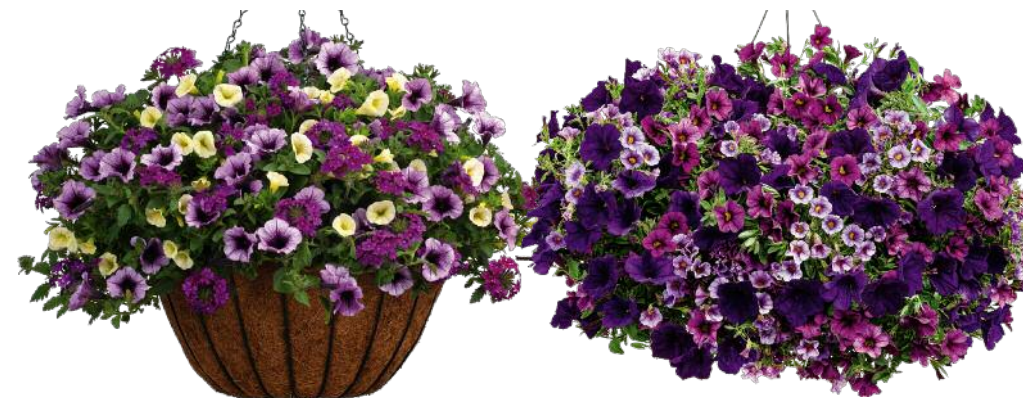
49. Wine Country Superbells® Yellow Chiffon™ Calibrachoa Supertunia® Bordeaux™ Petunia Superbena® Royale Plum Wine Verbena