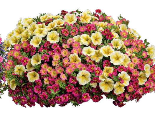
18. Aloha Superbells® Cherry Star® Calibrachoa Superbells® Sweet Tart™ Calibrachoa Supertunia® Limoncello™ Petunia