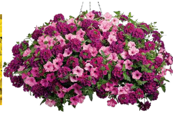
29. Hit It Big Supertunia® Vista Bubblegum® Petunia Superbena® Burgundy Verbena