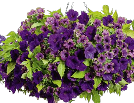
Believe in Fairies 'Sweet Caroline Light Green' Ipomoea SUPERTUNIA® Picasso in Blue® Petunia SUPERTUNIA® Royal Velvet™ Petunia