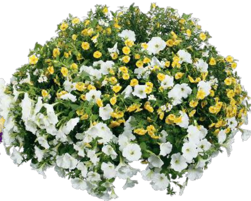
23. Banana Colada Superbells® Lemon Slice™ Calibrachoa Sunsatia® Coconut Nemesia Supertunia® White Petunia