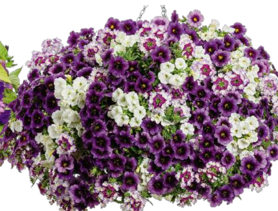
Avalon SUPERBELLS® Grape Punch™ Calibrachoa SUPERBELLS® White Calibrachoa SUPERBENA® Sparkling Amethyst Verbena