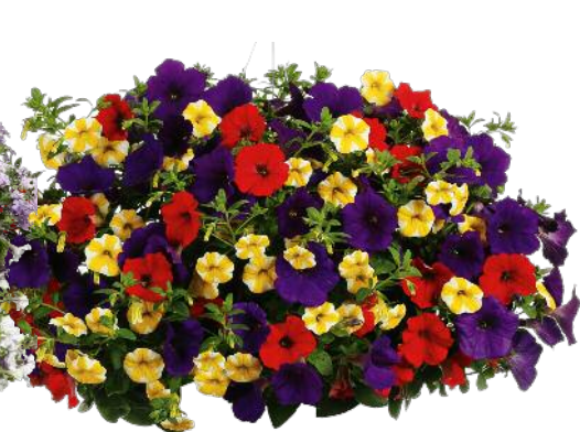
9. Starry Night Superbells® Lemon Slice™ Calibrachoa Supertunia® Royal Velvet™ Petunia Surfinia® Red Verbena