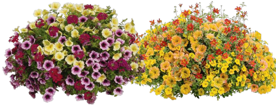
19. Girl's Night Out Supertunia® Bordeaux™ Petunia Supertunia® Limoncello™ Petunia Superbena® Royale Plum Wine Verbena