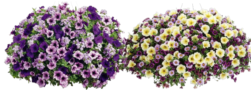
46. Geneva Terrace Supertunia® Bordeaux™ Petunia Supertunia® Royal Velvet™ Petunia Superbena® Large Lilac Blue Verbena