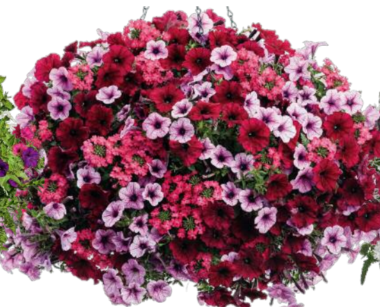
Tons of Fun SUPERTUNIA® Black Cherry™ Petunia SUPERTUNIA® Mini Rose Veined Petunia SUPERBENA® Royale Iced Cherry Verbena