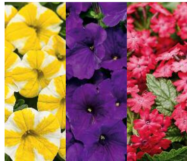
24. Berrylicious Superbells® Lemon Slice™ Calibrachoa Supertunia® Royal Velvet™ Petunia Superbena® Royale Iced Cherry Verbena