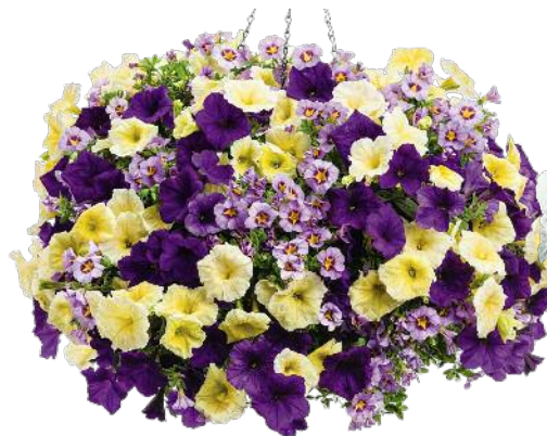
22. Afternoon Tea Superbells® Evening Star™ Calibrachoa Supertunia® Limoncello™ Petunia Supertunia® Royal Velvet™ Petunia