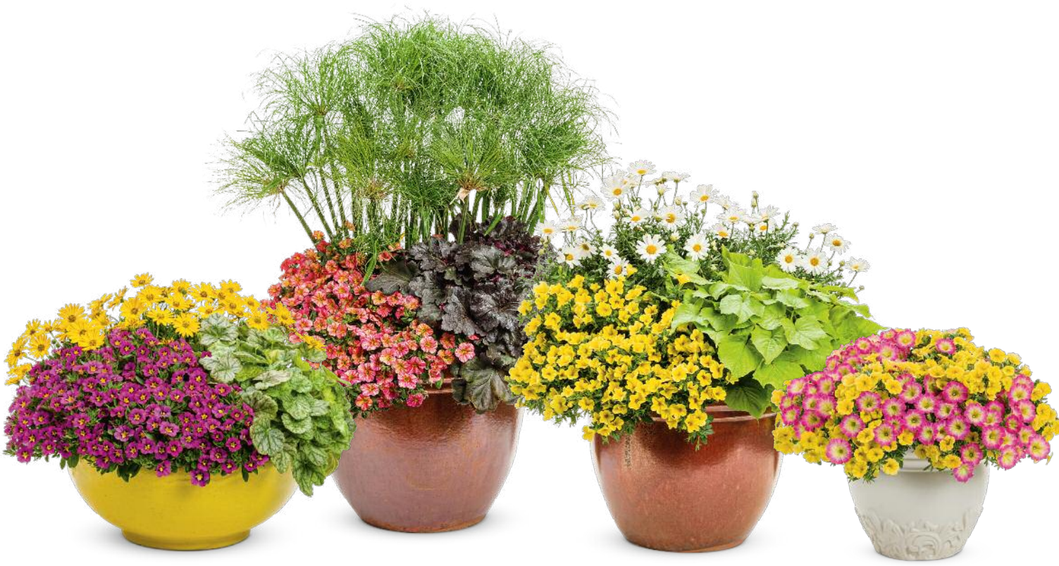
Apple of my Eye SUPERBELLS® Hollywood Star™ Calibrachoa BRIGHT LIGHTS™ Yellow Osteospermum DOLCE® 'Appletini' Heuchera