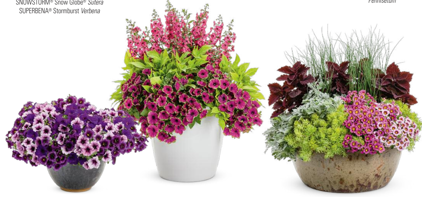
Home Again SUPERBELLS® Grape Punch™ Calibrachoa SUPERTUNIA® Bordeaux™ Petunia SUPERTUNIA® Royal Velvet™ Petunia