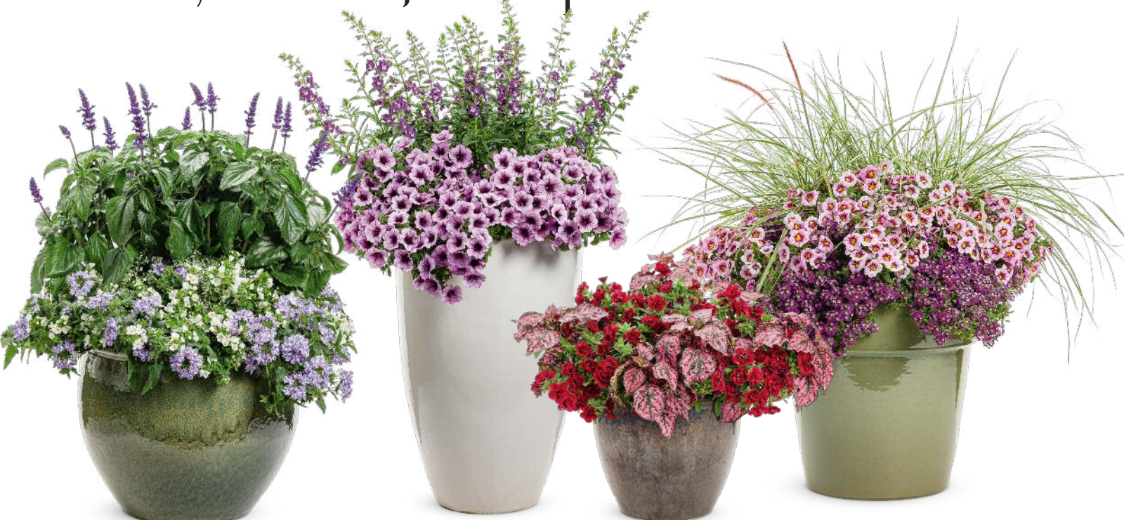
A Night at the Opera DIAMOND FROST® Euphorbia ROCKIN'™ Playin' the Blues® Improved Salvia SNOWSTORM® Snow Globe® Sutera SUPERBENA® Stormburst Verbena