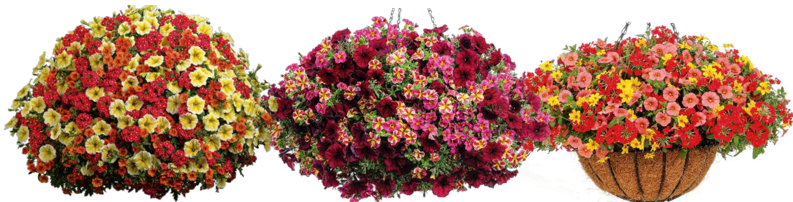
43. Patrick's Punch Superbells® Dreamsicle™ Calibrachoa Supertunia® Limoncello™ Petunia Tukana® Scarlet Star Verbena