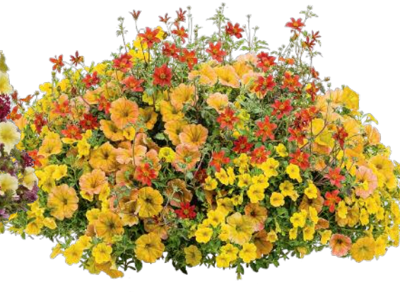
20. Honeybelle Campfire® Fireburst Improved Bidens Superbells® Yellow Calibrachoa Supertunia® Honey™ Petunia