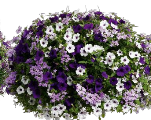
8. Lively in Lavender Supertunia® Mini Blue Veined Petunia Supertunia® Royal Velvet™ Petunia Superbena® Large Lilac Blue Verbena