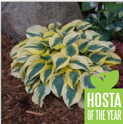
Shadowland® 'Autumn Frost' Hosta