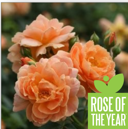
At Last® Rosa