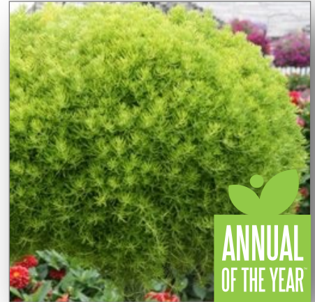
Lemon Coral™ Sedum

For more information on this program, visit www.provenwinners.com/Professionals_2019_National and www.nationalplantoftheyear.com .