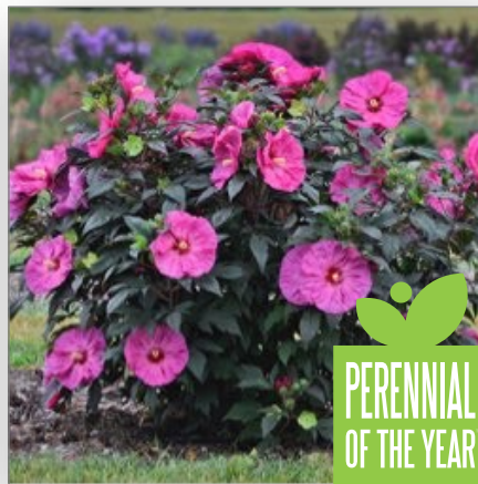
Summerific® 'Berry Awesome' Hibiscus