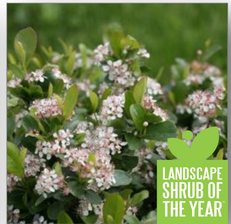
Low Scape® Mound Aronia