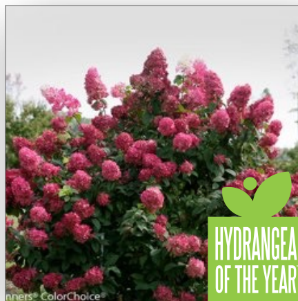
Fire Light® Hydrangea