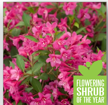
Sonic Bloom® Weigela series